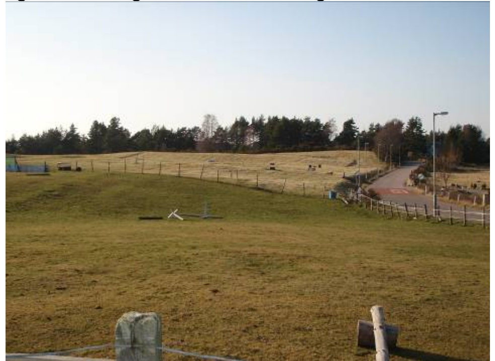
Fig 3 Site looking South from Tulloch Road, Duackbridge