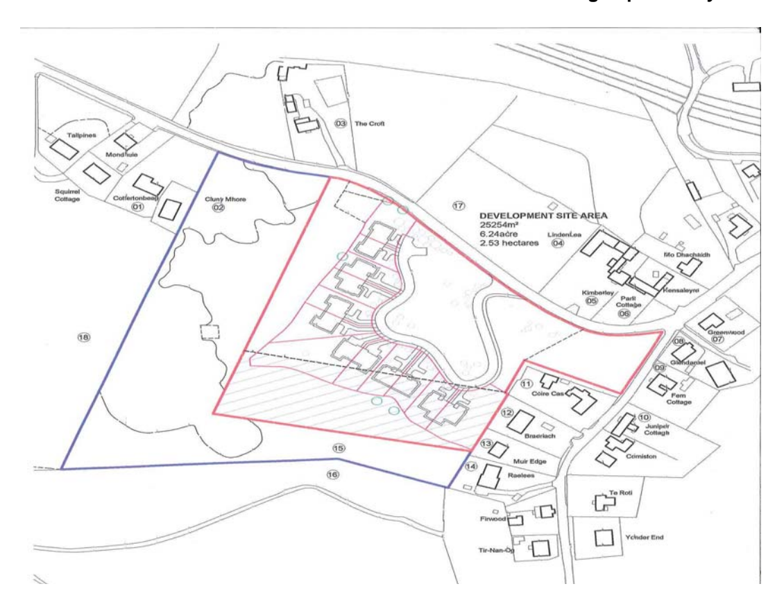
Fig. 4 Site Boundary and Indicative Site Layout