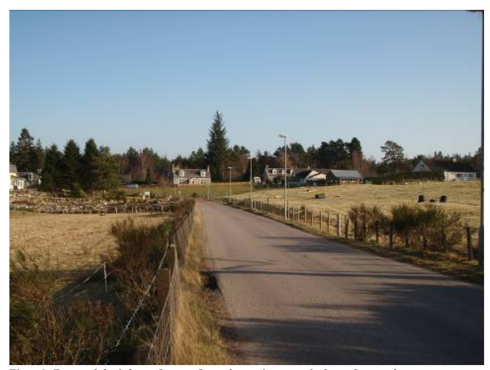
Fig. 2 Duackbridge from South - site to right of road